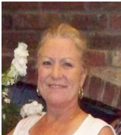
Mary Evans Non-Traditional Scholarship, 2010

“The help I’ve gotten from many people, including the Professional Business Women of Missouri, has empowered me to be the woman I’m supposed to be.”